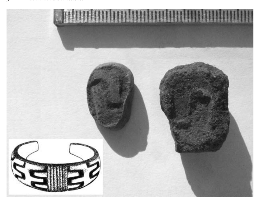
Fig. 1. Modern clay imprint and fragment of a mould for a Gotlandic armring, with a sketch of the ring; Stenberger's type Ab 3. Photograph and drawing by Anders Söderberg.

held together by litharge. Sometimes small pieces of bone are visible in the matrix.