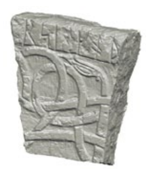
Relief-carved runestone fragment from Köping, Öland, with traces of working.

Linking information about runic inscriptions from different data sources opens the way for new research and for more complex questions, where runestones, for example, can be related to factors such as settlement, boundaries and communication routes, or to other ancient remains. To survey, register, digitize documents and images, and to coordinate digital data sources can give both research and cultural heritage management access to large amounts of open, high-quality and linked research data. Besides furthering runic studies, this source material can be used in archaeology, history, linguistics, conservation science, art history and other research fields. It also gives new possibilities to make knowledge of runes and runic inscriptions more accessible to everyone.