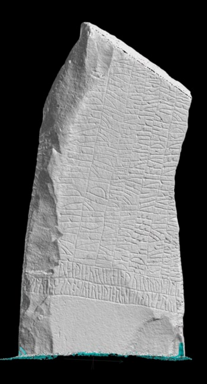
The Rök stone in Östergötland, depicted with the aid of 3D scanning. With this new technique one can study details in the carving grooves, and also the weather ing to which the stone is exposed.

Today there are other techniques for studying and documenting runic inscriptions, either in the field or in the National Heritage Board's laboratory in Visby. One technique is RTI, whereby objects are photographed with moving flashes so that researchers can then study the surfaces in detail, illuminated from several different angles, on a computer screen. Another new imaging technique is 3D scanning, by which a high-quality digital image of an object can be built up and then processed and analysed. 3D scanning of runic inscriptions gives detailed and colour-neutral documentation which can make it easier to read weathered and damaged inscriptions. The new technique also opens the way for new research fields, such as using the cut marks on runestones to study carving techniques and identify individual carvers.