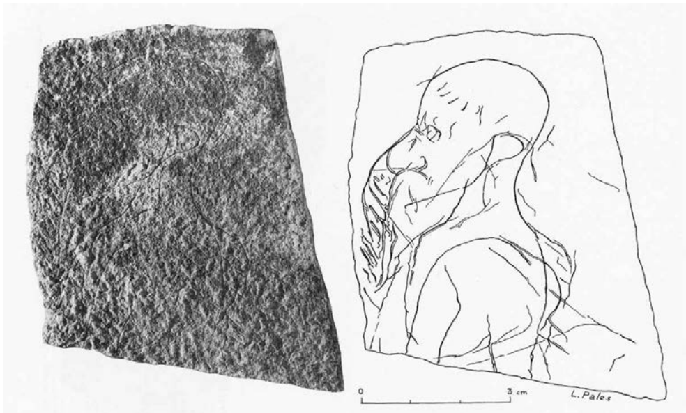
Fig. 4. Photograph of a slab with an incised man and drawing of the same signed L. Pales. Pales 1969–89.