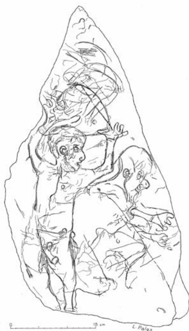
Fig. 1. Drawing signed L. Pales of a slab with two incised men. Pales 1969–89, pl. 156.