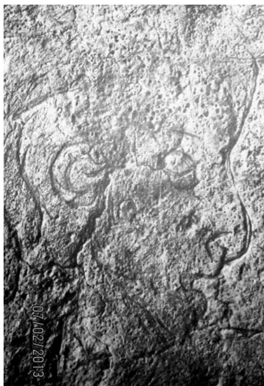
Fig. 2. Photograph of the slab in fig. 1, detail of a man's head. Pales 1969–89.

that is clearly distorted by the way the nostrils are accounted for. And it is difficult to find features in cave drawings that are not in a general accordance with nature. In this context there is a long series of similar heads, some of which have been frequently reproduced.