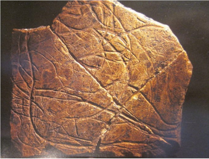
Fig. 7. Seated woman, engraved drawing on stone slab, La Marche. Musée Nationale des Antiquités Nationales, Saint-Germain-en-Laye.

at the time were obese. Obesity would not have been seen as a burden – it may have been considered an important and imposing quality, and rare at a time when starvation was a common experience (fig. 7).