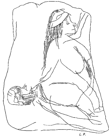
Fig. 6. Drawing signed L.P. of a slab with an obese woman and a bald bearded man. Pales 1969–89, pl. 108.