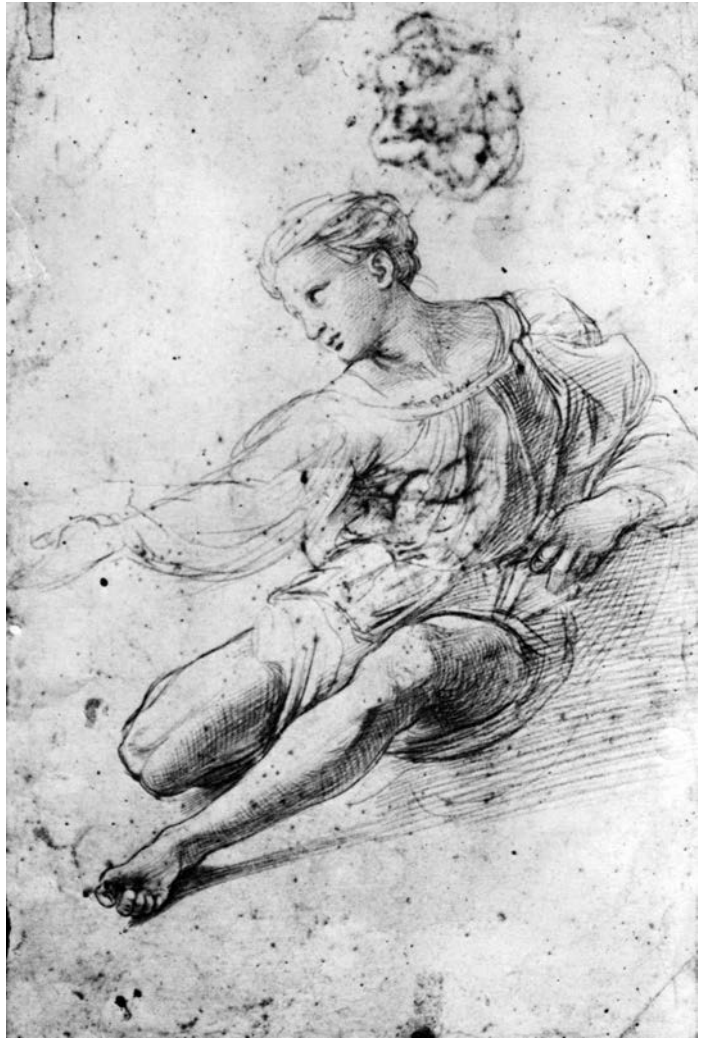
Fig. 8. Raphael, Study for the Alba Madonna, 1510. Sanguine, pen and ink. Palais des Beaux-Arts, Lille.